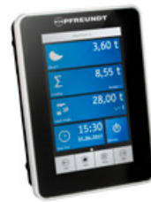
1 Weighing electronics