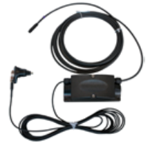
3 Radio modul