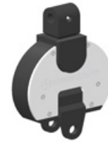
2 Measuring element KRW-2